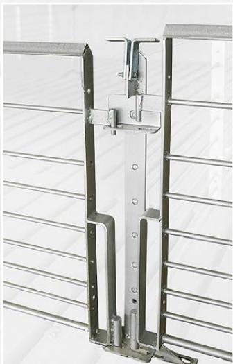
Pinless Latch Mechanism