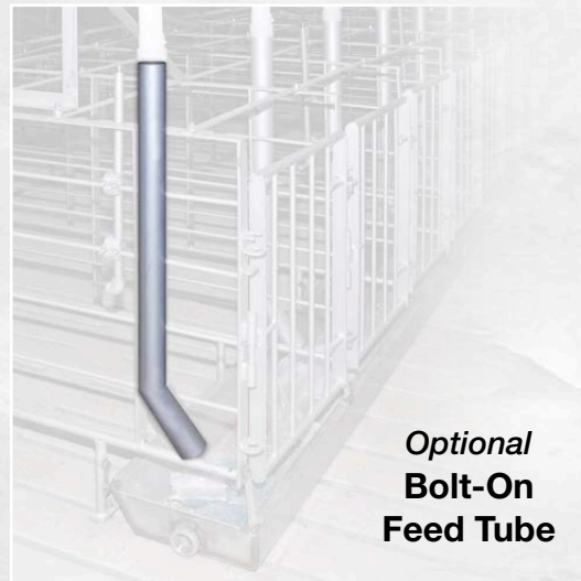
Optional Bolt-On Feed Tube